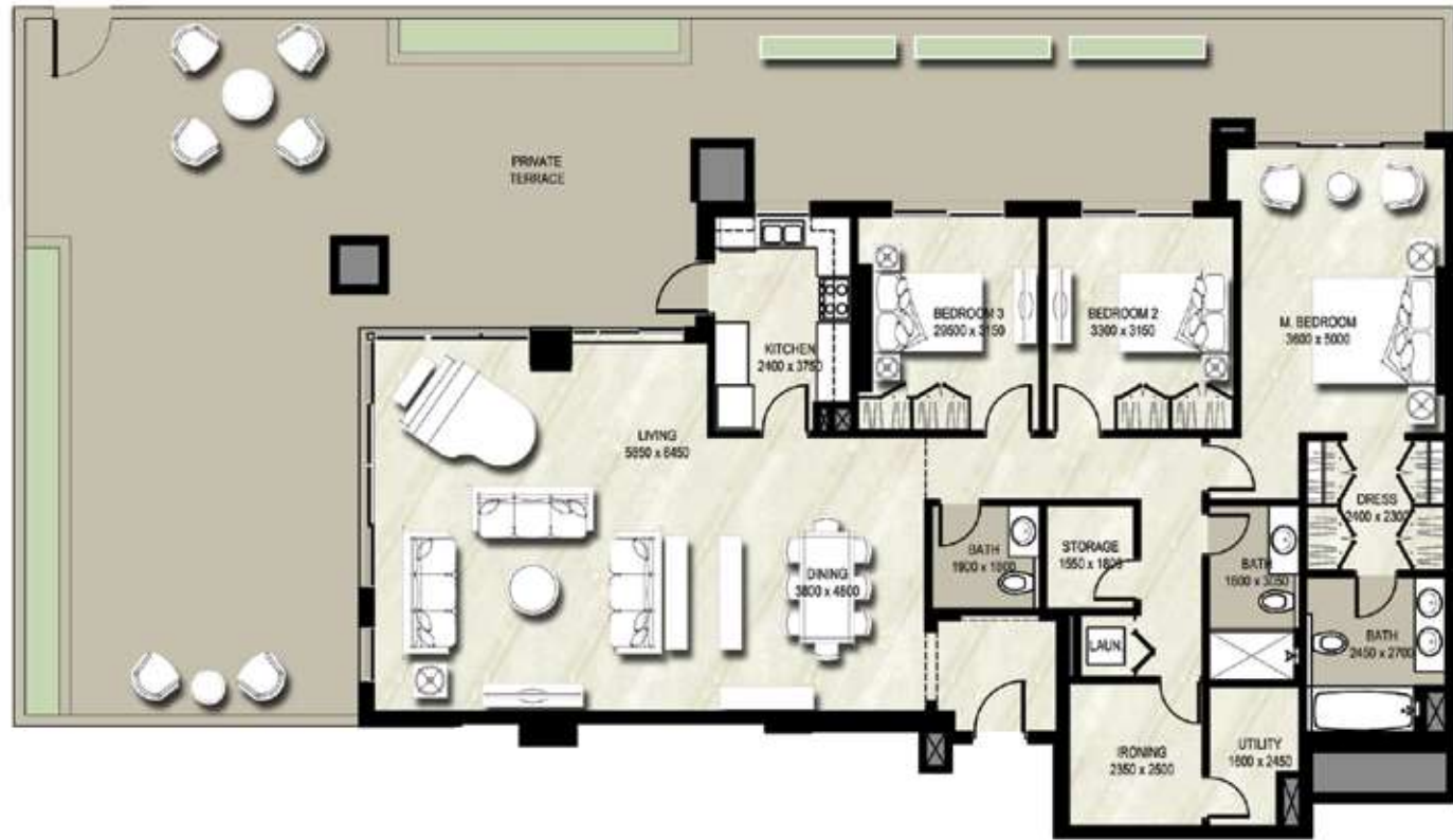
*Balcony sizes vary