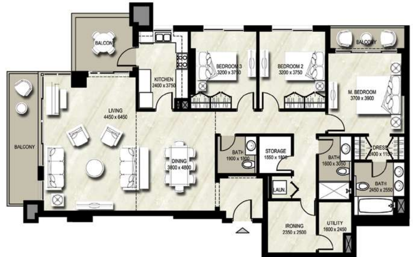
*Balcony sizes vary