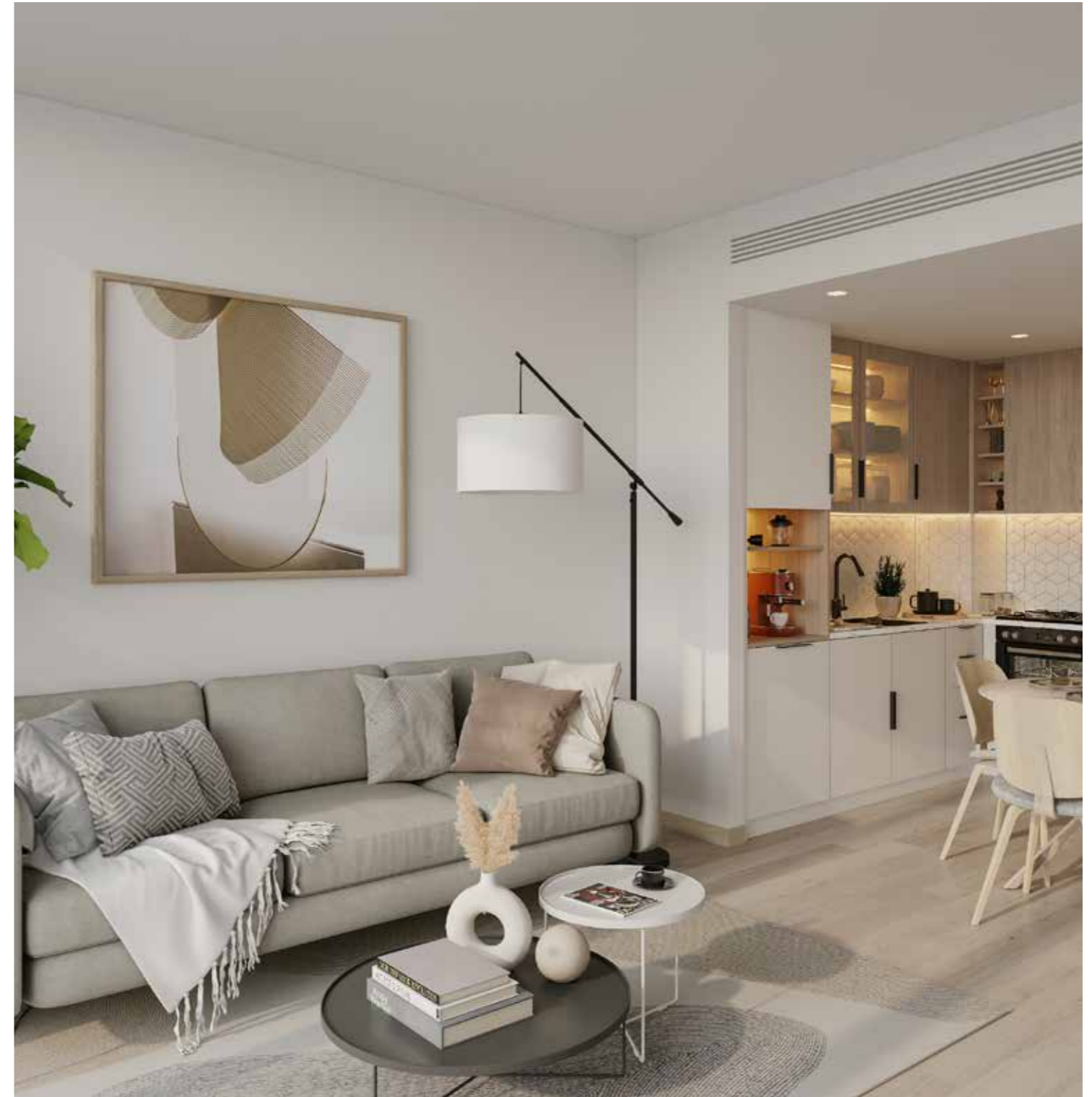
1 BEDROOM - LIVING ROOM